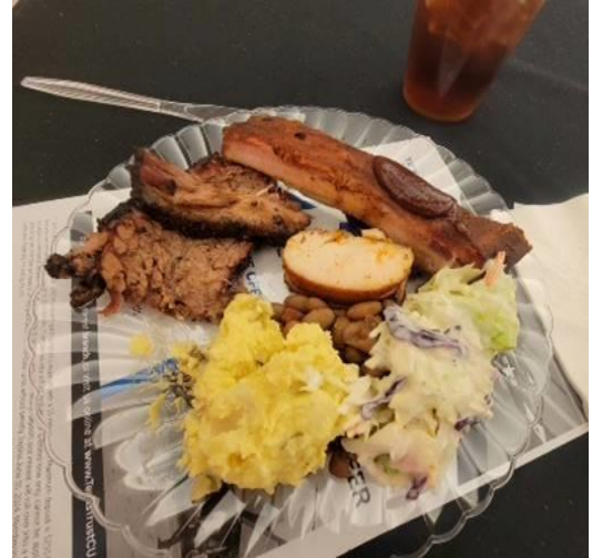
BBQ Lunch !