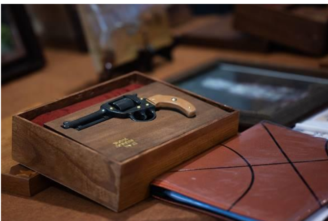
Al Schahn wood designs – pistol made from wood