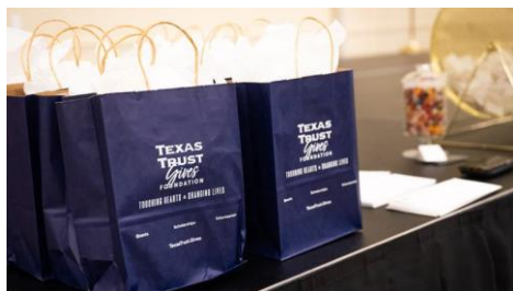
Door prizes and Jelly Bean jar