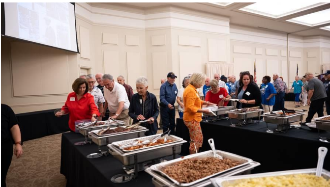
Attendees lining up for BBQ lunch