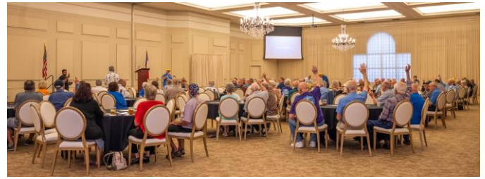
Attendees who were original members of the LTV Federal Credit Union