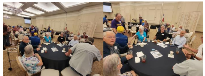
Mingling before the meeting