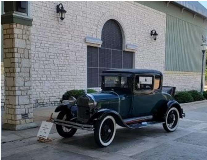
Al Schahn's Model A Ford