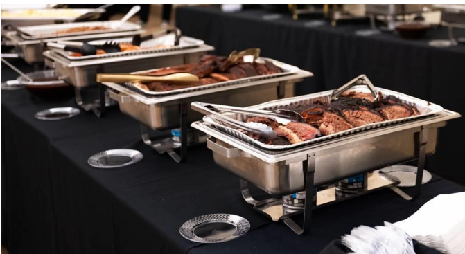
BBQ food pans