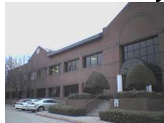
TTCU Business Park