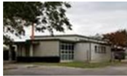
VHF Restoration Facility