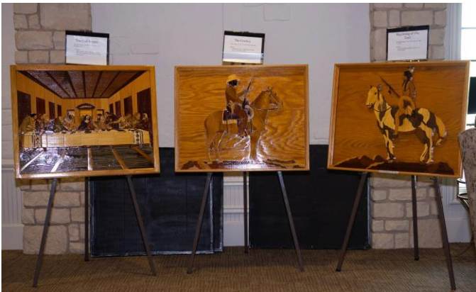
Wood Art by Wat Watkins