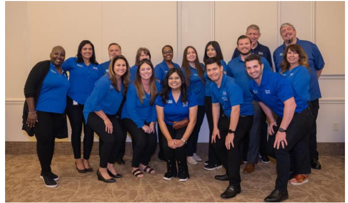
THANK YOU to all the TTCU Volunteers !!!