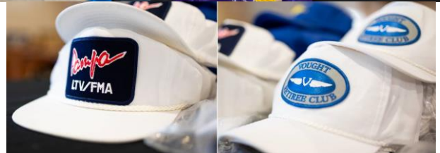
Memorabilia Sales Table – shirts and caps